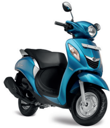
FASCINO India Yamaha Motor Pvt Ltd.