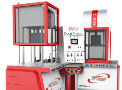
PMP DUAL WAX INJECTION PRESS PMP Machine Tools