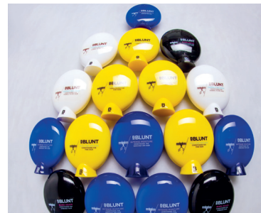
BBLUNT CONDITIONER Godrej Consumer Products Ltd.