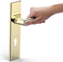
YUKO MORTISE HANDLE Godrej Locking Solutions And Systems