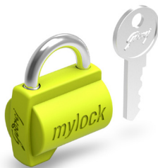
MYLOCK CANDY PADLOCK Godrej Locking Solutions And Systems