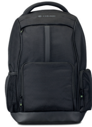
HAMPTON 3 LAPTOP BACKPACK VIP Industries Ltd.