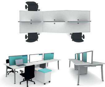
PROCEED Wipro Enterprises Ltd.