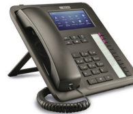
SPARSH VP330 Matrix Comsec Pvt Ltd.