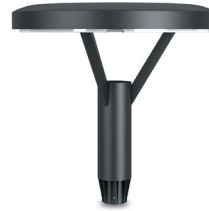
JUNO & JUNO MIDI K-Lite Industries