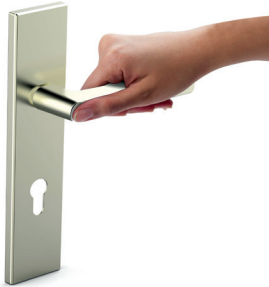
SWOOSH MORTISE HANDLE Godrej Locking Solutions And Systems