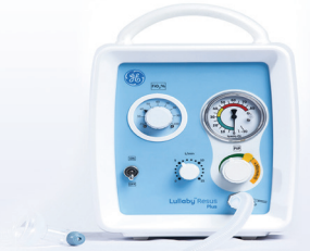
LULLABY RESUS PLUS GE Healthcare