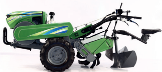
KMW MEGA T 15 Kirloskar Oil Engines Ltd.