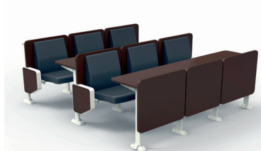
ENLIGHTEN LECTURE THEATRE FURNITURE SYSTEM Godrej Interio