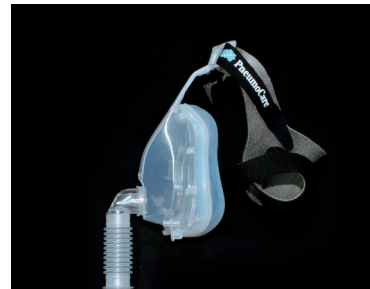
PNEUMOCARE'S EASY2CLEAN HOSPITAL NON INVASIVE VENTILATION MASK. Pneumo Care Health Pvt Ltd.