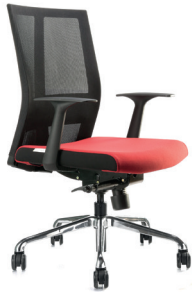
PULSE CHAIR RANGE Godrej Interio