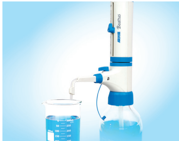
BEATUS BOTTLE TOP DISPENSER Microlit