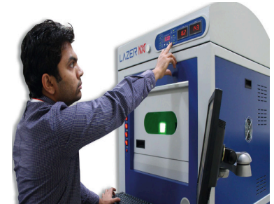
LAZER NXT Sahajanand Technologies Private Ltd.