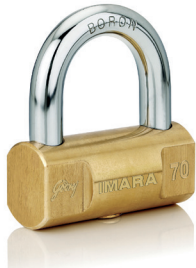
IMARA PADLOCK Godrej Locking Solutions And Systems