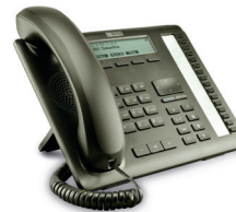
SPARSH VP510E Matrix Comsec Pvt Ltd.