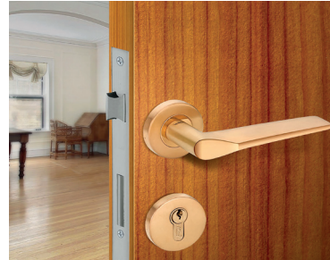
MORTISE HANDLE Kich Architectural Products Pvt Ltd.