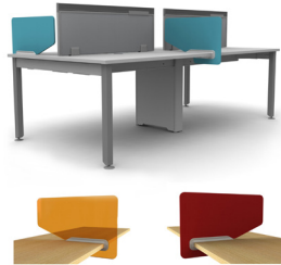
SNAPPY Wipro Enterprises Ltd.