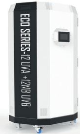
KRUPA - PUVA PHOTO CHEMOTHERAPY UNIT Krupa Medi Scan