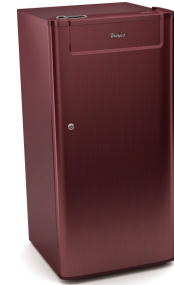
GENIUS SINGLE DOOR REFRIGERATOR Whirlpool