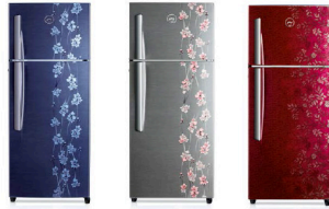
GODREJ FROST FREE REFRIGERATOR SPRING RANGE1 Godrej & Boyce Mfg. Co. Ltd.