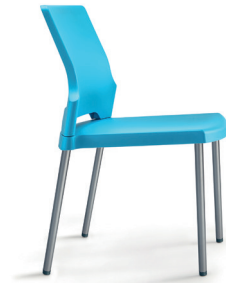
UNWIND CHAIR RANGE Godrej Interio