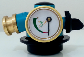
GAS SAFETY DEVICE Sohum Autogas Systems Pvt Ltd.