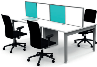
VIRTU Wipro Enterprises Ltd.