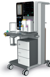
ANAESTHESIA WORKSTATION Medion Healthcare Pvt Ltd.