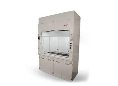
'POLYPRO' SERIES PP FUME HOOD Labguard India Pvt Ltd.