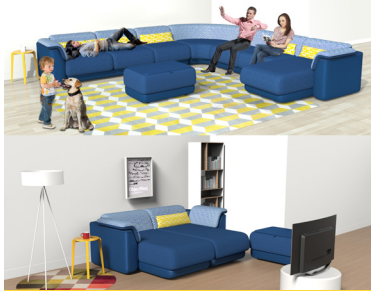
BROADWAY SOFA RANGE Godrej Interio