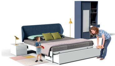
LIVA RANGE Godrej Interio