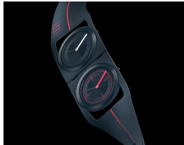
TRAVELLER'S EDGE Titan Company Ltd.