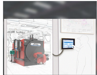
EFFIMAX Forbes Marshall Pvt Ltd.