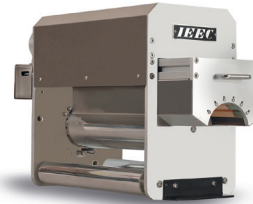
NARROW WEB CORONA TREATMENT SYSTEM PBJ Industrial Electronics Pvt Ltd.