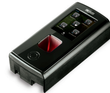
COSEC VEGA FAX Matrix Comsec Pvt Ltd.