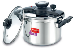
CLIP-ON PRESSURE COOKWARE TTK Prestige Ltd.