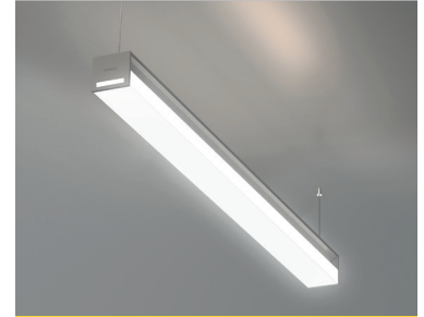
PIE LED Wipro Enterprises Pvt Ltd.