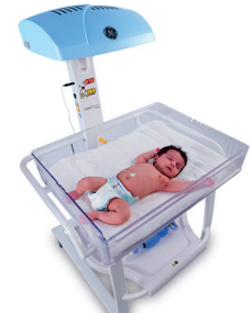
LULLABY WARMER PRIME GE Healthcare