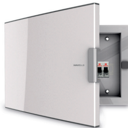
METALICA DISTRIBUTION BOARD Havells India Ltd.