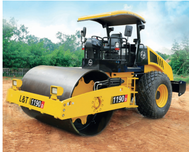
L&T 1190D - 11T SOIL COMPACTOR L&T Construction Equipment Ltd.