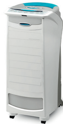
SILVER I Symphony Ltd.