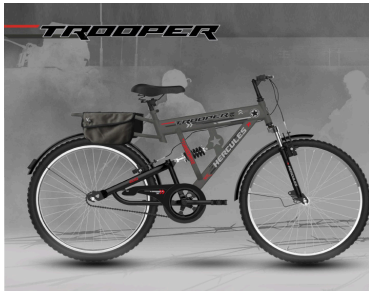
HERCULES TROOPER TI Cycles Of India